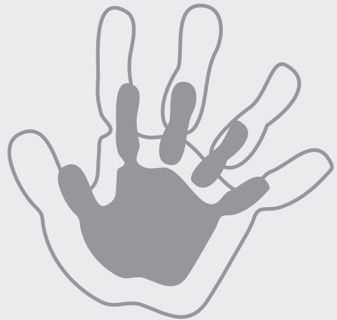
Original hand size of an extremely preterm, compared to a term newborn 8

Due to medical advances, the rates of preterm born babies with sensory or neuromotor impairments have significantly decreased during the past two decades 7 . Nevertheless, they remain at greater risk of developing short- and long-term health complications e.g. affecting the cardio-vascular system, lung, digestive tract, brain, hearing, or vision, compared to term born infants 2 . Thus, preterm born babies need assessments of their development and follow-up check-ups at close intervals.